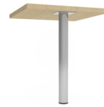
Chrome pole leg