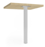
White pole leg